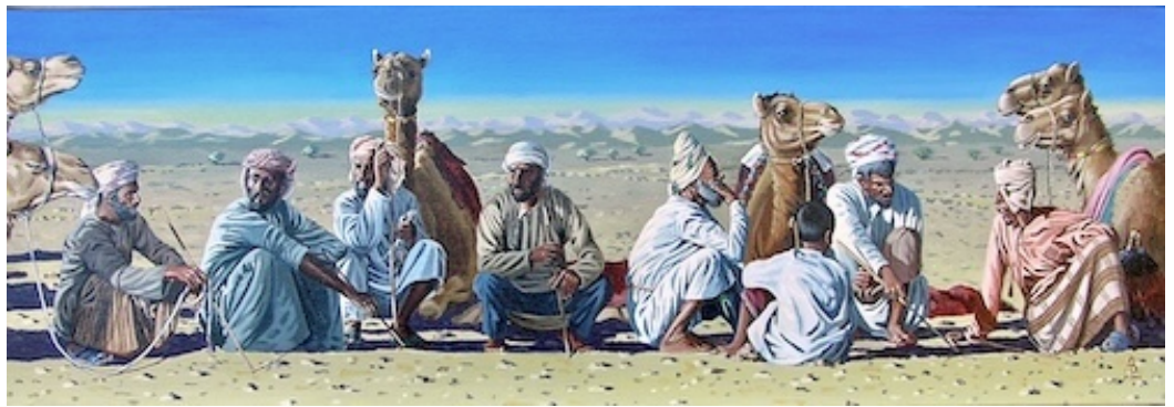
"Early Morning Camel Races, Oman" acrylic, 20 x 60cm

Now for my story beyond the canvas. I attended art college in London and was offered an apprenticeship by the great jewellery designer Andrew Grima. However, "storing" my art side I worked in educational publishing, No. 10 Downing Street and intelligence. This experience included a spell in Saigon during the Vietnam War and Islamabad in the India-Pakistan war of 1971, which I had intended to do since the age of eight living in Cyprus during the Eoka Cyprus Emergency.