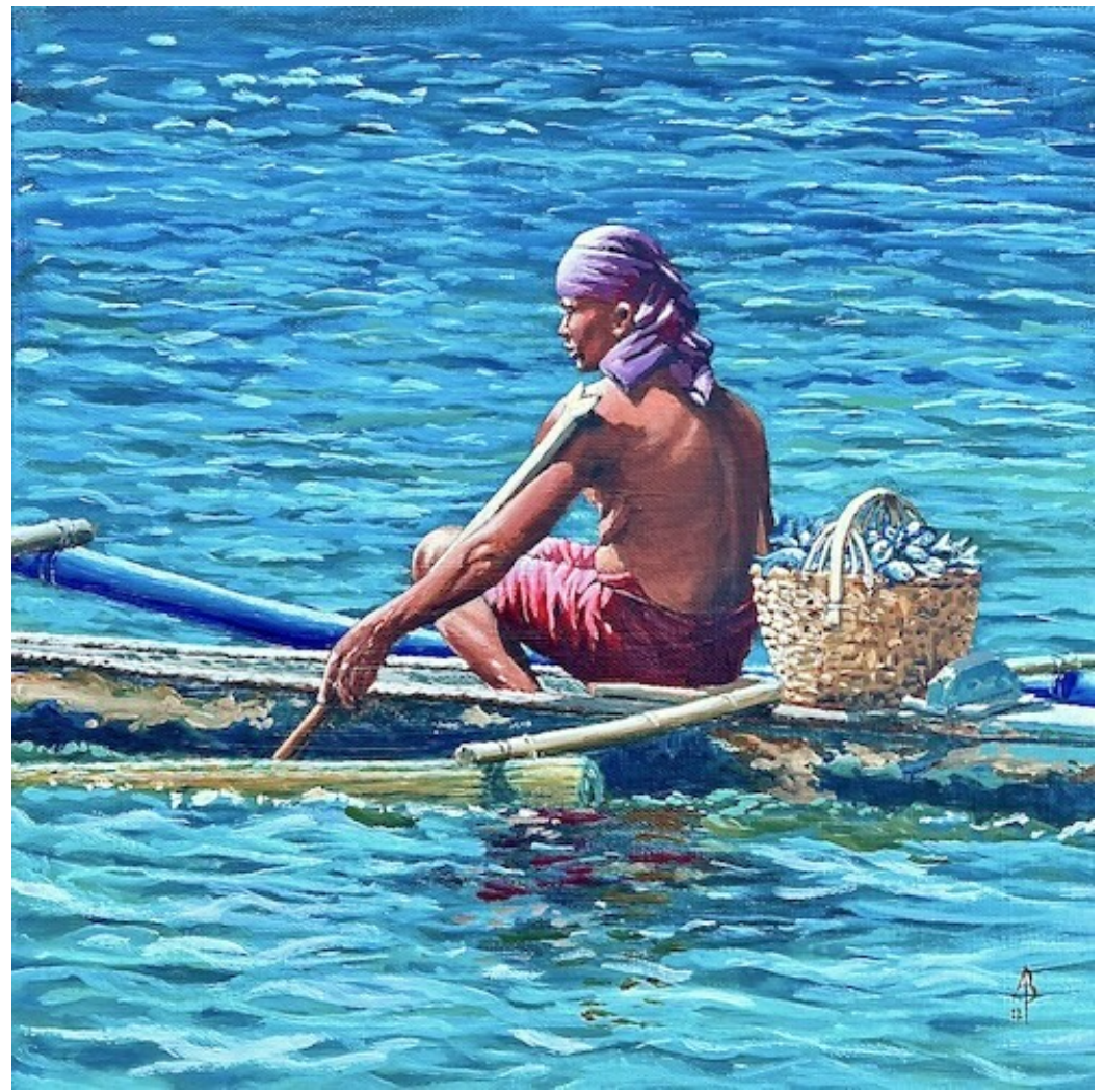
"A Good Day's Catch, Philippines" acrylic, 30 x 30cm

In the 1980s I had three wonderful years in Oman. Just before leaving, the late ruler Sultan Qaboos bin Said commissioned 25 paintings. Clutching a letter from his palace, I dashed around the country visiting military units, bands and orchestras, aircraft and naval ships, recording everything I needed for painting back in the UK. A British woman bearing palace instructions to comply with my wishes must have been a total novelty!