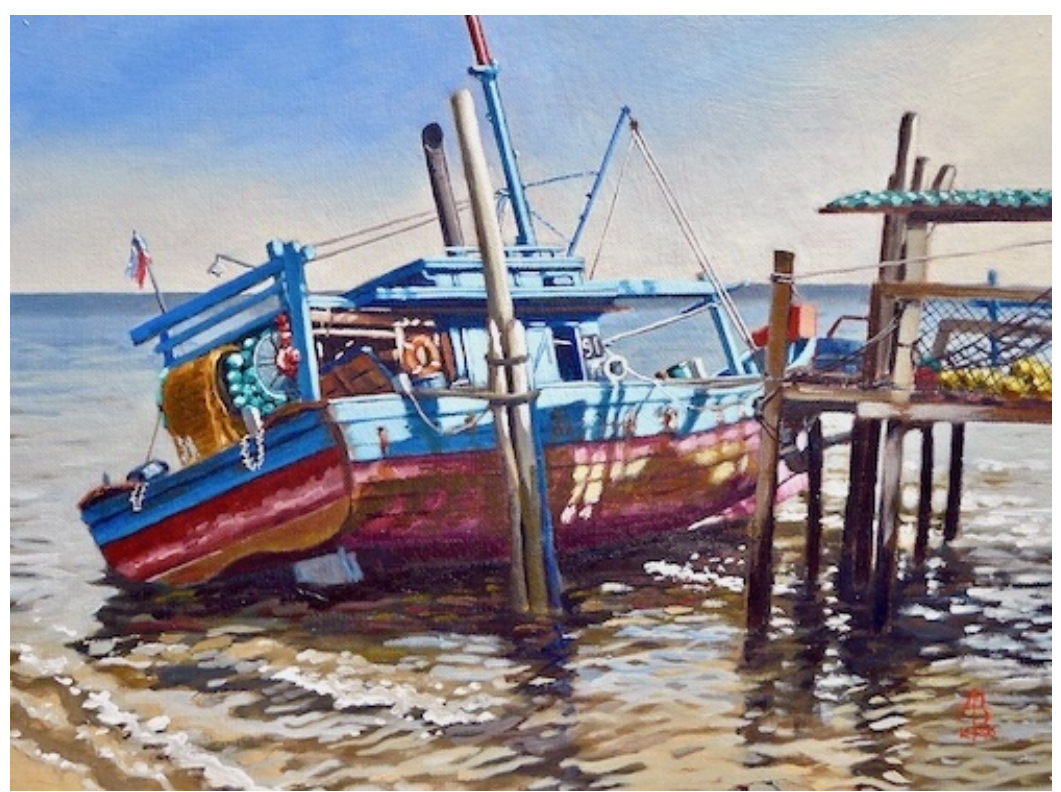
"Low Tide, Penang" oil, 30 x 40cm

Nowadays, it's surprising how someone remembers their kit in battle often differently to the next person. It was fun counting rivets on WWI tanks and finding no two with the same number. Women in the armaments factories just riveted randomly!