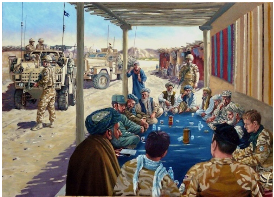
"1st Queen's Dragoon Guards, Afghanistan" oil, 50 x 70cm