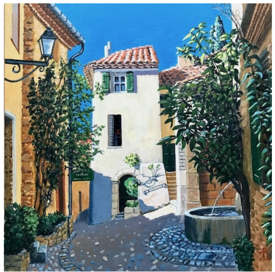
"Sunlight, Seguret, Provence" acrylic, 40 x 40cm

A dry profession? Not at all! I was asked to go on a Royal Navy ship in the middle of winter in the North Sea when heavily pregnant (I declined). Subsequently I was asked to go to Bosnia, but the military unit was spread widely and there was concern that taking me around might make me appear more like Jemima Bond! At a bad financial moment I got a nice commission from China to design a box for a WW2 military modelling kit. One painting was lost in the sinking of HMS Sheffield in the Falklands War, and others in the Iraq invasion of Kuwait.