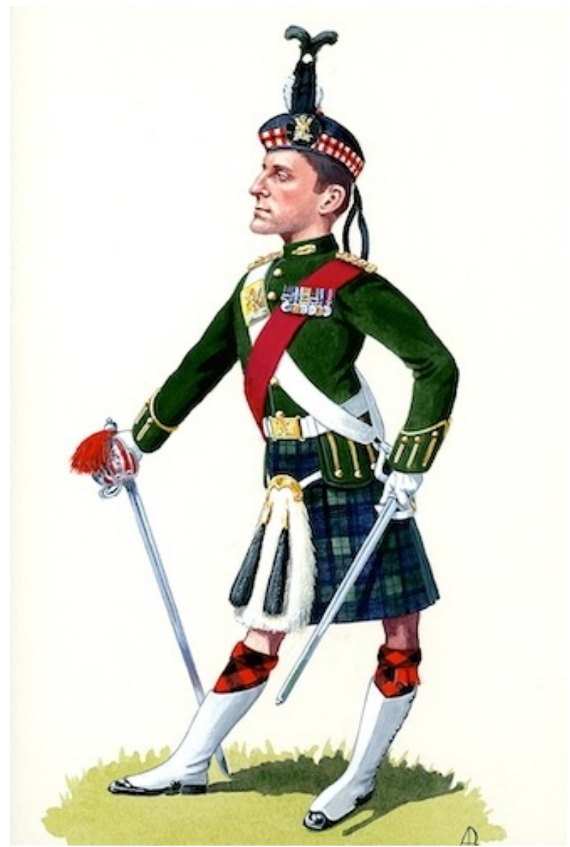
"Caricature of Commanding Officer" 2 SCOTS" acrylic, 35 x 25cm

Perhaps due to looking for a quieter life, art came knocking. I let it gradually emerge during a posting to Singapore. I'd always been interested in military history and the evolution of dress in combat. That is frequently very different to military regulations and requires deep research in contemporaneous journals and, eventually, photographs.